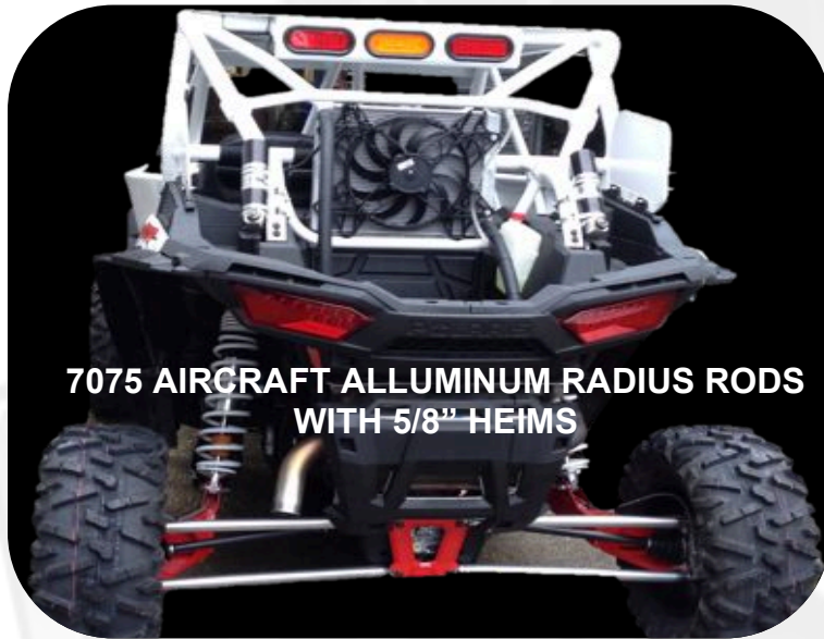
7075 AIRCRAFT ALLUMINUM RADIUS RODS WITH 5/8" HEIMS