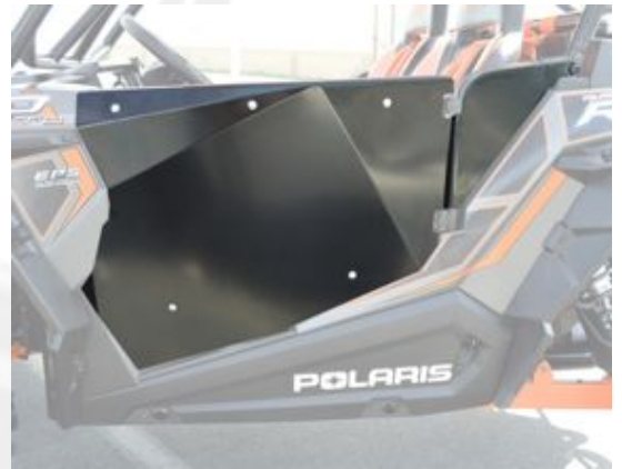
PRP XP1000 DOORS