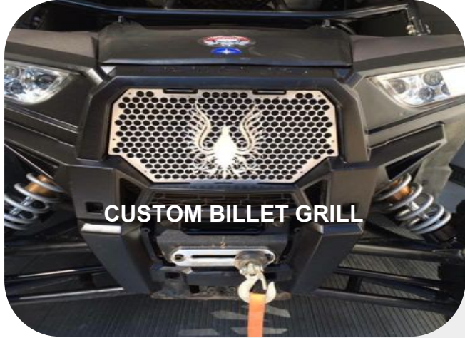
CUSTOM BILLET GRILL