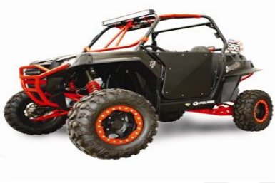
DFR HIBOY DOOR RZR 570