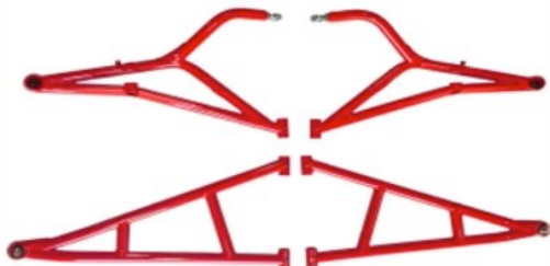
XP1000 FRONT A ARM ( 0+ ) W/ UNI-BALLS