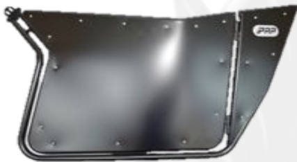
PRP DOORS XP900