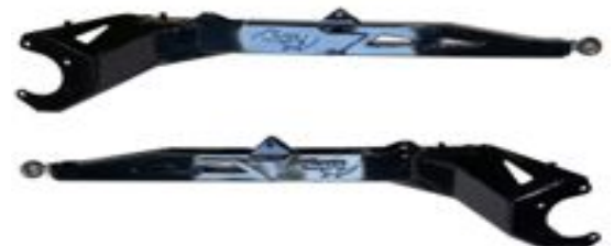
HI-CLEARANCE REAR TRAILING ARMS XP1000