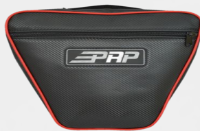
UNIVERSAL DOOR BAG